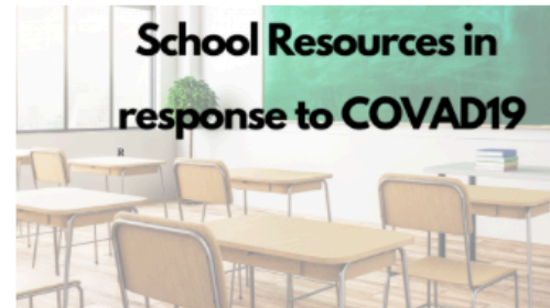
RESOURCES FOR SCHOOLS DURING CLOS...