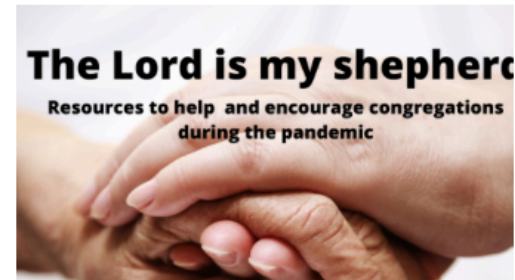
THE COVID-19 CORONAVIRUS