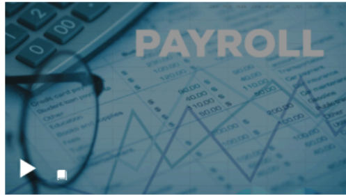
PAYCHECK PROTECTION PROGRAM