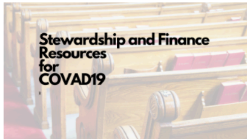
STEWARDSHIP & CHURCH FINANCE RESO...